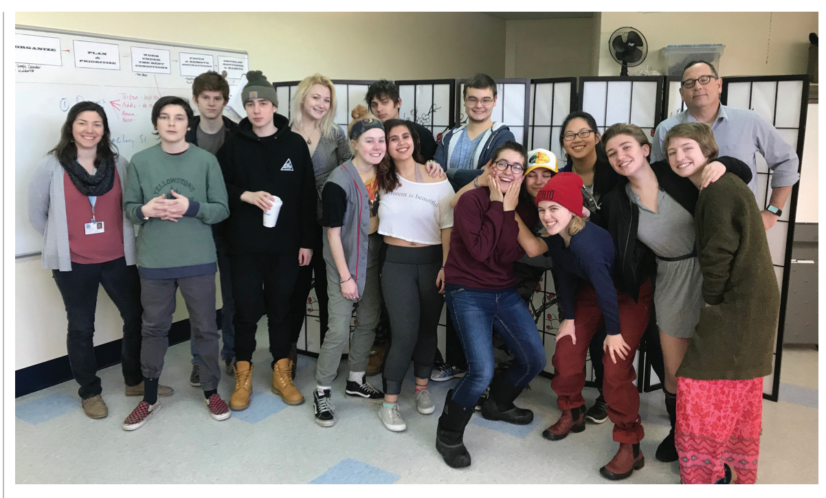
Students from Big Picture South Burlington hosted an event for Vermont high school students to exhibit their unique and innovative projects.